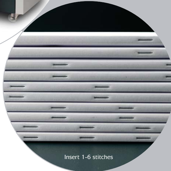
Insert 1-6 stitches