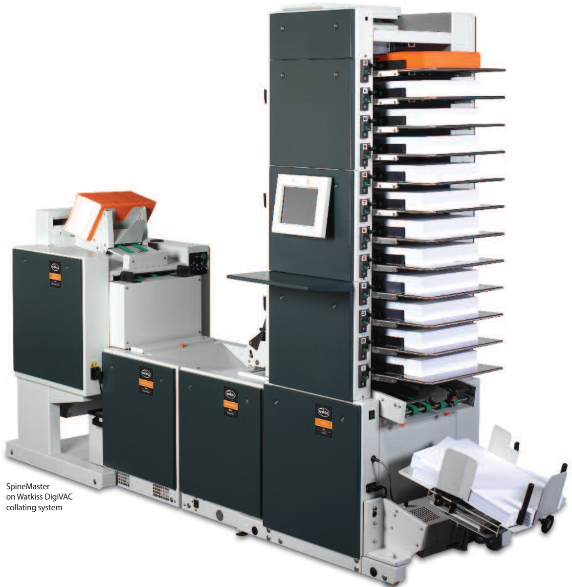
SpineMaster on Watkiss DigiVAC collating system

Print on the Spine SquareBack booklets can carry print on the spine, just like a perfect bound book.