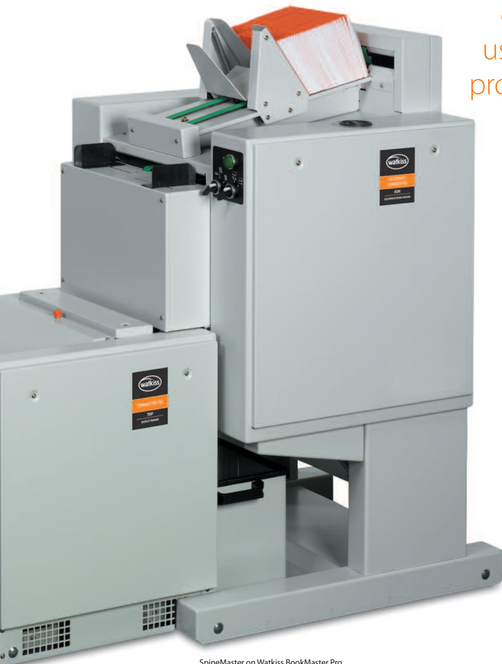
SpineMaster on Watkiss BookMaster Pro